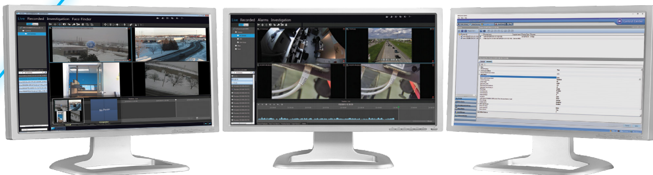
Comprehensive video monitoring, management and health awareness.