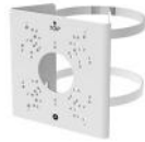
MS-7CBK627D Pole Mount